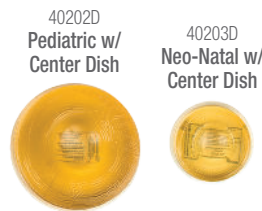
Neo-Natal w/ Center Dish enlarged to show dished style.